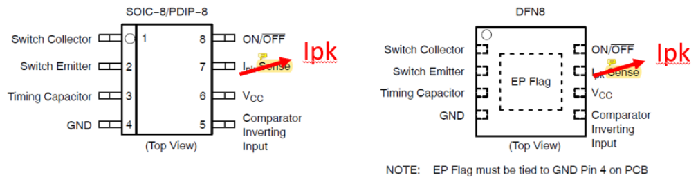
Figure 2. Pin Connections