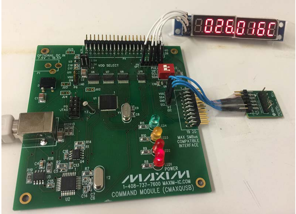
Figure 2. Temperature monitoring setup.