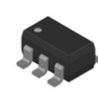
NCV303LSN20T1G Fairchild Semiconductor POWER SUPPLY SUPPORT CIRCUIT, FI