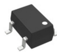
NCV303LSN29T1G onsemi IC SUPERVISOR 1 CHANNEL 5TSOP