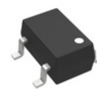
NCV303LSN27T1G onsemi IC SUPERVISOR 1 CHANNEL 5TSOP