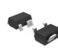
NCV304LSQ33T1G onsemi IC SUPERVISOR 1 CHANNEL SC82AB