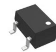
NCV303LSN28T1G onsemi IC SUPERVISOR 1 CHANNEL 5TSOP