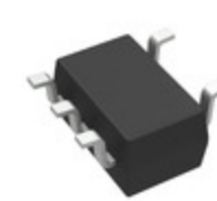
NCV303LSN17T1G onsemi IC SUPERVISOR 1 CHANNEL 5TSOP