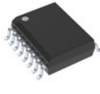
ADUM4135BRWZ Analog Devices Inc. DGTL ISO 5KV 1CH GATE DVR 16SOIC