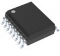
ADUM3442CRWZ-RL Analog Devices Inc. DGTL ISO 2500VRMS 4CH GP 16SOIC