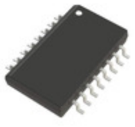
ADUM4070ARIZ Analog Devices Inc. IC REG PSH-PULL ADJ 350MA 16SOIC