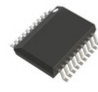
ADUM3471WCRSZ Analog Devices Inc. DGTL ISO 2500VRMS 4CH GP 20SSOP