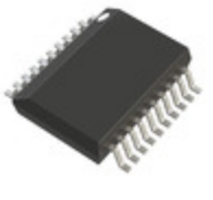
ADUM3472WARSZ Analog Devices Inc. DGTL ISO 2500VRMS 4CH GP 20SSOP