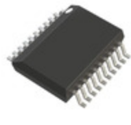
ADUM3471ARSZ-RL7 Analog Devices Inc. DGTL ISO 2500VRMS 4CH GP 20SSOP