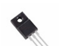
STGF15H60DF STMicroelectronics IGBT 600V 30A 30W TO220FP