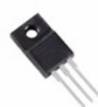
STGF15M65DF2 STMicroelectronics TRENCH GATE FIELD-STOP IGBT M SE