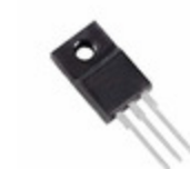
STGF20M65DF2 STMicroelectronics IGBT TRENCH 650V 40A TO220FP