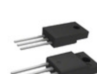
STGF14NC60KD STMicroelectronics IGBT 600V 11A 28W TO220FP