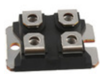
STGE50NC60WD STMicroelectronics IGBT MOD 600V 100A 260W ISOTOP