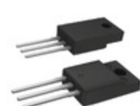
STGF10M65DF2 STMicroelectronics IGBT TRENCH 650V 20A TO220FP