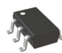
74V1T08STR STMicroelectronics IC GATE AND 1CH 2-INP SOT23-5