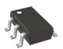
74V1T125STR STMicroelectronics IC BUF NON-INVERT 5.5V SOT23-5