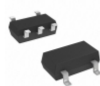
74V1T08CTR STMicroelectronics IC GATE AND 1CH 2-INP SOT323-5