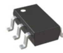
74V1T66STR STMicroelectronics IC SWITCH SPST-NOX1 100HM SOT23