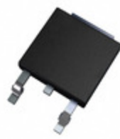
T810-600B-TR STMicroelectronics TRIAC SENS GATE 600V 8A DPAK