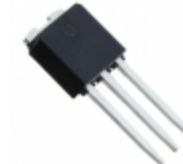
T810-600H STMicroelectronics TRIAC SENS GATE 600V 8A IPAK