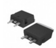
T810H-6G-TR STMicroelectronics TRIAC SENS GATE 600V 8A D2PAK