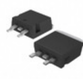
T810H-6G STMicroelectronics TRIAC SENS GATE 600V 8A D2PAK