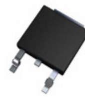
T810-600B STMicroelectronics TRIAC SENS GATE 600V 8A DPAK