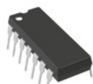
AD8182AN Analog Devices Inc. IC MULTIPLEXER DUAL 2X1 14DIP