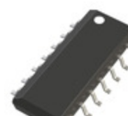
AD8182AR-REEL7 Analog Devices Inc. IC MULTIPLEXER DUAL 2X1 14SOIC