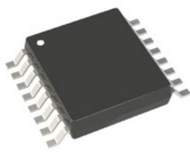
Image may be representation. See specifications for product details.