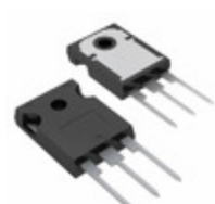
STW38NB20 STMicroelectronics MOSFET N-CH 200V 38A TO247-3