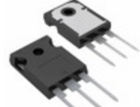
STW40N20 STMicroelectronics MOSFET N-CH 200V 40A TO247-3