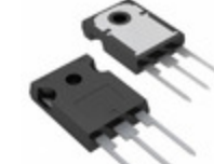
STW35N65M5 STMicroelectronics MOSFET N-CH 650V 27A TO247-3