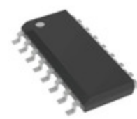
ST3222EBDR STMicroelectronics IC TRANSCEIVER FULL 2/2 16SO