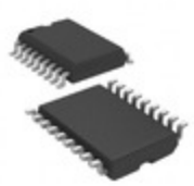
ST3222ECDR STMicroelectronics IC TRANSCEIVER FULL 2/2 18SO