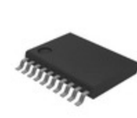
ST3222BTR STMicroelectronics IC TRANSCEIVER FULL 2/2 20TSSOP