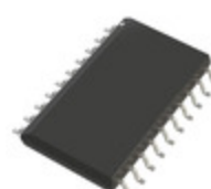
ADM2587EBRWZ Analog Devices Inc. DGT ISO 2.5KV RS422/RS485 20SOIC