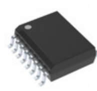
ADUM4223CRWZ-RL Analog Devices Inc. DGTL ISO 5KV 2CH GATE DVR 16SOIC