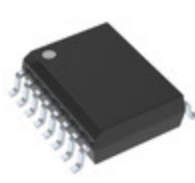
ADUM4223BRWZ Analog Devices Inc. DGTL ISO 5KV 2CH GATE DVR 16SOIC