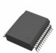
ADUM4137WBRNZ Analog Devices Inc. 6A AUTOMOTIVE ISOLATED GATE DRIV