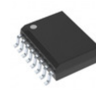
ADUM4223ARWZ Analog Devices Inc. DGTL ISO 5KV 2CH GATE DVR 16SOIC