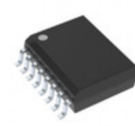
ADUM4223BRWZ-RL Analog Devices Inc. DGTL ISO 5KV 2CH GATE DVR 16SOIC