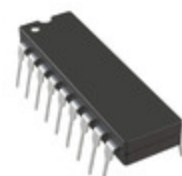
AD977AANZ Analog Devices Inc. IC ADC 16BIT SAR 20DIP