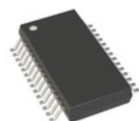
AD977ARS Analog Devices Inc. IC ADC 16BIT SAR 28SSOP