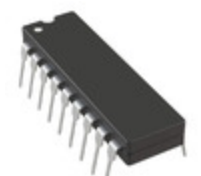
AD977AN Analog Devices Inc. IC ADC 16BIT SAR 20DIP