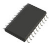
AD977ARZ Analog Devices Inc. IC ADC 16BIT SAR 20SOIC