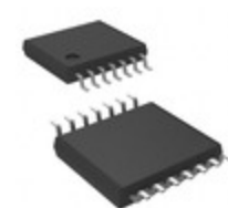
MC14013BDTR2G onsemi IC FF D-TYPE DUAL 1BIT 14TSSOP