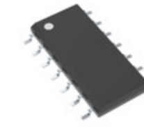
MC14012BD onsemi IC GATE NAND 2CH 4-INP 14SOIC