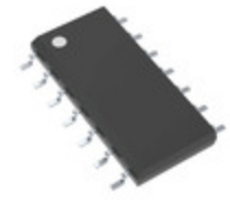
MC14012BDR2G onsemi IC GATE NAND 2CH 4-INP 14SOIC