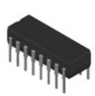
MC14014BCL onsemi SHIFT REGISTER, 8-BIT