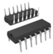
MC14013BCPG onsemi IC FF D-TYPE DUAL 1BIT 14DIP