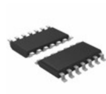
MC14012BFEL onsemi IC GATE NAND 2CH 4-INP SOEIAJ-14