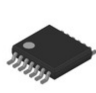
MC14013BDT onsemi D FLIP-FLOP