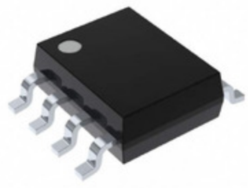
Image may be representation. See specifications for product details.