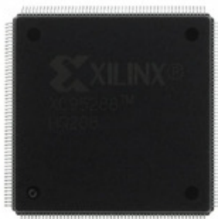
Image may be representation. See specifications for product details.