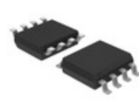
MIC4429CM Microchip Technology IC GATE DRVR LOW-SIDE 8SOIC