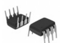
MIC4427ZN Microchip Technology IC GATE DRVR LOW-SIDE 8DIP