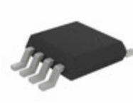
MIC4428YMM Microchip Technology IC GATE DRVR LOW-SIDE 8MSOP