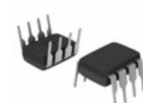
MIC4429CN Microchip Technology IC GATE DRVR LOW-SIDE 8DIP