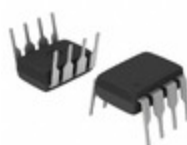
MIC4429BN Microchip Technology IC GATE DRVR LOW-SIDE 8DIP