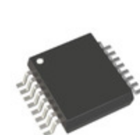
AD5570BRS Analog Devices Inc. IC DAC 16BIT V-OUT 16SSOP