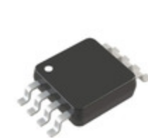
AD5553CRMZ-REEL7 Analog Devices Inc. IC DAC 14BIT A-OUT 8MSOP