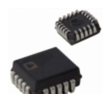
AD557JP Analog Devices Inc. IC DAC 8BIT V-OUT 20PLCC