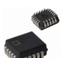
AD557JPZ Analog Devices Inc. IC DAC 8BIT V-OUT 20PLCC