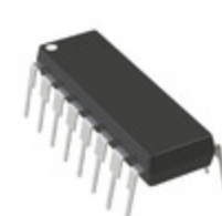
AD557JN Analog Devices Inc. IC DAC 8BIT V-OUT 16DIP