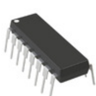
AD557JNZ Analog Devices Inc. IC DAC 8BIT V-OUT 16DIP