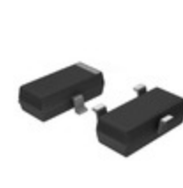
BZX84C11 Diotec Semiconductor ZENER SOT-23 11V 0.3W 5%