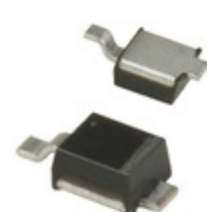
1PMT12AT1 onsemi TVS DIODE 12VWM 19.9VC POWERMITE