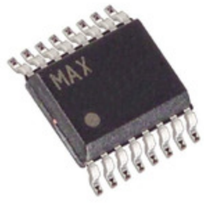
Image may be representation. See specifications for product details.