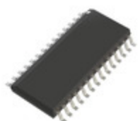
AD974BRZ Analog Devices Inc. IC DAS 16BIT 200K 28SOIC