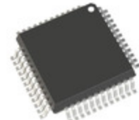
AD9751ASTZ Analog Devices Inc. IC DAC 10BIT A-OUT 48LQFP