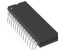
AD974AN Analog Devices Inc. IC DAS 16BIT 200K 28DIP