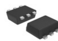
NSVT30010MXV6T1G onsemi TRANS 2PNP 30V 0.1A SOT563