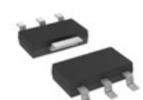
NSVPZTA92T1G onsemi TRANS PNP 300V 0.5A SOT223