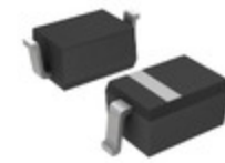
NSVR1020MW2T1G onsemi DIODE SCHOTTKY 20V 1A SOD323