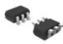
NSVMUN5336DW1T1G onsemi COMPLEMENTARY DIGITAL TRA