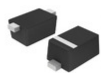
NSVR0520V2T1G onsemi DIODE SCHOTTKY 20V 500MA SOD523