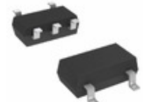
NSVUMC2NT1G onsemi TRANS NPN/PNP PREBIAS 0.15W SC70