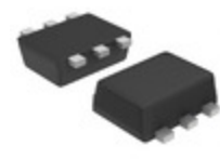
NSVR0320XV6T1G onsemi DIODE SCHOTTKY 23V 1A SOT563