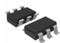
NSVT489AMT1G onsemi TRANS NPN 30V 2A 6TSOP