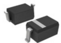
NSVR0170HT1G onsemi DIODE SCHOTTKY 70V 70MA SOD323