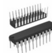
MC14514BCP onsemi IC DECODER/DEMUX 1X4:16 24DIP