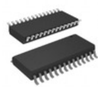
MC145152DW2 NXP USA Inc. IC PLL CLOCK/FREQ SYNTH 28SOIC