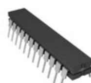
AD7845BQ Analog Devices Inc. IC DAC 12BIT V-OUT 24CDIP