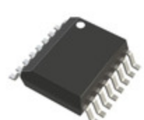
AD7843ARQ-REEL Analog Devices Inc. IC ADC 12BIT TOUCHSCREEN 16-QSOP