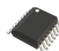
AD7843ARQ Analog Devices Inc. IC ADC 12BIT TOUCHSCREEN 16-QSOP