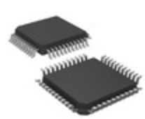
AD7841BSZ Analog Devices Inc. IC DAC 14BIT V-OUT 44MQFP