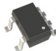
ADP130AUJZ-1.8-R7 Analog Devices Inc. IC REG LINEAR 1.8V 350MA TSOT5