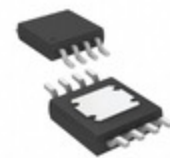
ADP125ARHZ-R7 Analog Devices Inc. IC REG LIN POS ADJ 500MA 8MSOP