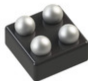
ADP150ACBZ-1.8-R7 Analog Devices Inc. IC REG LINEAR 1.8V 150MA 4WLCSP