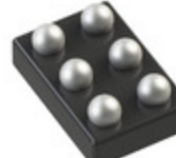
ADP1290ACBZ-R7 Analog Devices Inc. IC PWR SWITCH N-CHAN 1:1 6WLCSP