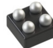
ADP150ACBZ-2.8-R7 Analog Devices Inc. IC REG LINEAR 2.8V 150MA 4WLCSP