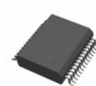
ADUM4137WBRNZ Analog Devices Inc. 6A AUTOMOTIVE ISOLATED GATE DRIV