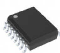
ADUM4135BRWZ Analog Devices Inc. DGTL ISO 5KV 1CH GATE DVR 16SOIC