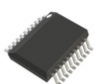
ADUM3474CRSZ Analog Devices Inc. DGTL ISO 2500VRMS 4CH GP 20SSOP