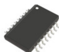
ADUM4070ARIZ Analog Devices Inc. IC REG PSH-PULL ADJ 350MA 16SOIC