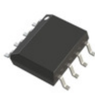
REF191ES Analog Devices Inc. IC VREF SERIES 0.1% 8SOIC