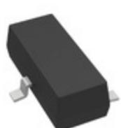
REF1112AIDBZRG4 Texas Instruments IC VREF SHUNT 0.2% SOT23-3