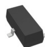
REF1112AIDBZR Texas Instruments IC VREF SHUNT 0.2% SOT23-3