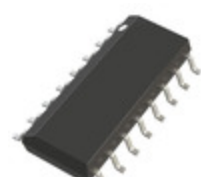
AD807A-155BRZ Analog Devices Inc. IC RECEIVER 0/1 16SOIC