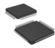
XC9572XL-7VQ64I AMD IC CPLD 72MC 7.5NS 64VQFP