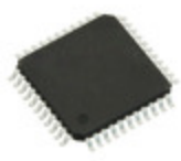
XC9572XL-7VQ44I AMD IC CPLD 72MC 7.5NS 44VQFP