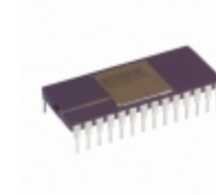
AD773AJD Analog Devices Inc. IC ADC 10BIT MONO 20MSPS 28-CDIP