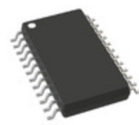
AD7739BRUZ-REEL7 Analog Devices Inc. IC ADC 24BIT SIGMA-DELTA 24TSSOP