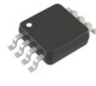
AD7740KRM Analog Devices Inc. IC V/F CONV 1MHZ 8MSOP