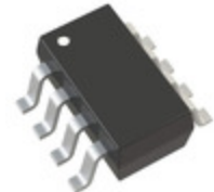
AD7740YRTZ-REEL7 Analog Devices Inc. IC V/F CONV 1MHZ SOT23-8