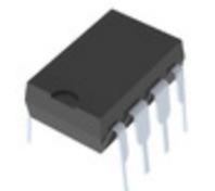
AD7741BNZ Analog Devices Inc. IC V/F CONV 6.144MHZ 8DIP