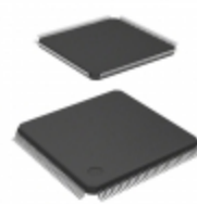
STM32F207ZET6TR STMicroelectronics IC MCU 32BIT 512KB FLASH 144LQFP