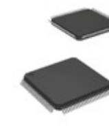
STM32F217VGT6TR STMicroelectronics IC MCU 32BIT 1MB FLASH 100LQFP