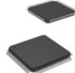
STM32F217VGT6 STMicroelectronics IC MCU 32BIT 1MB FLASH 100LQFP