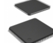
STM32F207ZGT7 STMicroelectronics IC MCU 32BIT 1MB FLASH 144LQFP