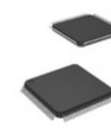
STM32F217VET6 STMicroelectronics IC MCU 32BIT 512KB FLASH 100LQFP