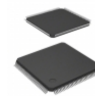
STM32F207ZGT6 STMicroelectronics IC MCU 32BIT 1MB FLASH 144LQFP