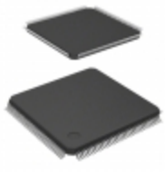
STM32F207ZGT6TR STMicroelectronics IC MCU 32BIT 1MB FLASH 144LQFP