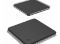
STM32F215ZET6 STMicroelectronics IC MCU 32BIT 512KB FLASH 144LQFP