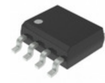
AT24C16AN-10SI-1.8 Microchip Technology IC EEPROM 16KBIT I2C 8SOIC