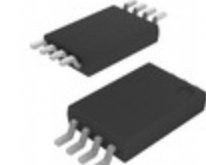
AT24C16A-10TI-2.7 Microchip Technology IC EEPROM 16KBIT I2C 8TSSOP