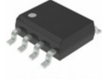
AT24C164-10SU-2.7 Microchip Technology IC EEPROM 16KBIT I2C 8SOIC