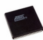
ATF1508ASV-15JU84 Microchip Technology IC CPLD 128MC 15NS 84PLCC