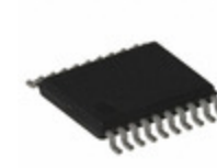
ATF16LV8C-15XC Microchip Technology IC PLD 8MC 15NS 20TSSOP