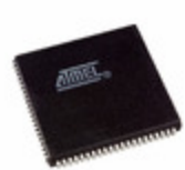
ATF1508ASV-15JC84 Microchip Technology IC CPLD 128MC 15NS 84PLCC