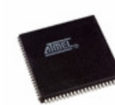
ATF1508ASVL-20JC84 Microchip Technology IC CPLD 128MC 20NS 84PLCC