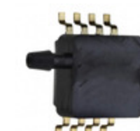
MPXV5010GP NXP USA Inc. SENSOR 1.45PSIG 0.13" 4.7V 8SOP