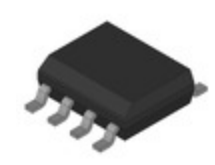
MPXV5100DP Freescale Semiconductor SENSOR 14.5PSID 0.13" 4.7V 8SOP