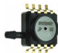
MPXV5004GVP NXP USA Inc. SENSOR 0.57PSIG 0.13" 4.9V 8SOP