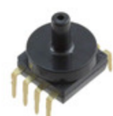
MPXV5010GC7U NXP USA Inc. SENSOR 1.45PSIG 0.13" 4.7V 8DIP