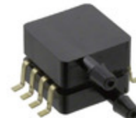
MPXV2202DPT1 NXP USA Inc. SENSOR 29.01PSID 0.13" .04V 8SOP