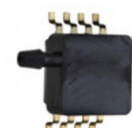
MPXV2102GP NXP USA Inc. SENSOR 14.5PSIG 0.13" .04V 8SOP