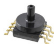
MPXV5010GC6U NXP USA Inc. SENSOR 1.45PSIG 0.13" 4.7V