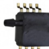
MPXV5050GP NXP USA Inc. SENSOR 7.25PSIG 0.13" 4.7V 8SOP