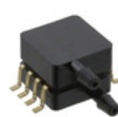
MPXV4006DP NXP USA Inc. SENSOR 0.87PSID 0.13" 4.7V 8SOP