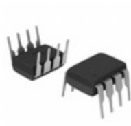
AT17C128-10PI Microchip Technology IC SERIAL CONFIG PROM 128K 8DIP