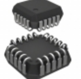
AT17C512-10JC Microchip Technology IC SER CONFIG PROM 512K 20PLCC