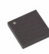
AT17LV002-10CU Microchip Technology IC SRL CONFIG EEPROM 2M 8-LAP