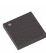
AT17F080A-30CU Microchip Technology IC FLASH CONFIG 8M 8LAP