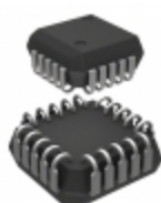
AT17C256-10JI Microchip Technology IC SER CONFIG PROM 256K 20PLCC