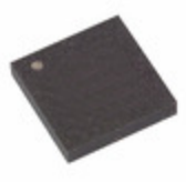
AT17F080-30CU Microchip Technology IC FLASH CONFIG 8M 8LAP