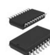
AT17C256-10SI Microchip Technology IC EEPROM FPGA 256KB 20-SOIC