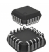
AT17C65-10JC Microchip Technology IC SERIAL CONFIG PROM 64K 20PLCC