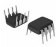
AT17C256-10PC Microchip Technology IC SERIAL CONFIG PROM 256K 8DIP