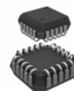
AT17C512A-10JC Microchip Technology IC SER CONFIG PROM 512K 20PLCC