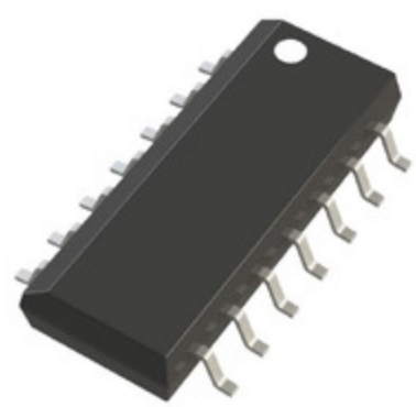
Image may be representation. See specifications for product details.