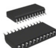
STP16DPPS05MTR STMicroelectronics IC LED DRIVER LINEAR 40MA 24SOP