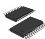
STP16CPS05TTR STMicroelectronics IC LED DRVR LINEAR 100MA 24TSSOP