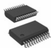
STP16CPS05PTR STMicroelectronics IC LED DRVR LINEAR 100MA 24QSOP