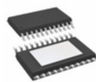
STP16CPS05XTTR STMicroelectronics IC LED DRVR LINEAR 100MA 24TSSOP