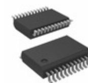
STP16CPPS05PTR STMicroelectronics IC LED DRIVER LINEAR 40MA 24QSOP