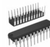
STP16DP05B1R STMicroelectronics IC LED DRIVER LINEAR 100MA 24DIP