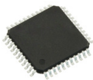
Image may be representation. See specifications for product details.