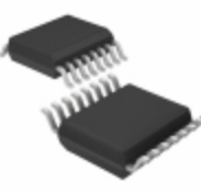
74FST3257DTR2G onsemi IC MUX/DEMUX 4 X 2:1 16TSSOP