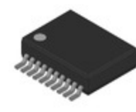
74FST3345QS onsemi BUS DRIVER