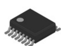
74FST3244Q IDT, Integrated Device Technology Inc