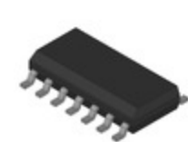
74FST3126D onsemi BUS DRIVER