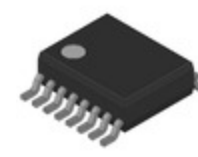
74FST3125Q IDT, Integrated Device Technology Inc 74FST3125 - 16-BIT BUS SWITCH