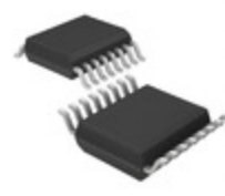
74FST3126QSR onsemi IC BUS SWITCH 1 X 1:1 16QSOP