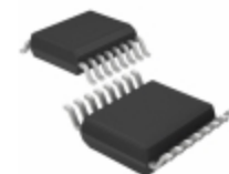
74FST3257DTR2 onsemi IC MUX/DEMUX 4 X 2:1 16TSSOP