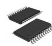
74FST3383DTR2 onsemi IC BUS FET EXCH SW 5X2:2 24TSSOP