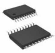
74FST3245DTR2 onsemi IC BUS SWITCH 8 X 1:1 20TSSOP