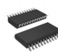
74FST3384DWR2 onsemi IC BUS SWITCH 5 X 1:1 24SOIC