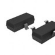
MCP1812AT-033/TT Microchip Technology IC REG LINEAR 3.3V 300MA SOT23-3