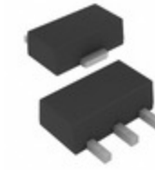
MCP1804T-A002I/MB Microchip Technology IC REG LINEAR 10V 150MA SOT89-3