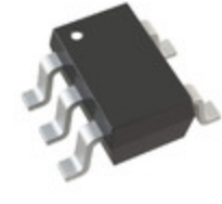
MCP1811AT-033/LT Microchip Technology IC REG LINEAR 3.3V 150MA SC70-5