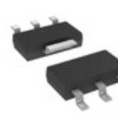
MCP1804T-5002I/DB Microchip Technology IC REG LINEAR 5V 150MA SOT223-3