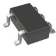
MCP1812AT-033/OT Microchip Technology IC REG LINEAR 3.3V 300MA SOT23-5