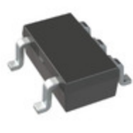
MCP1812BT-040/OT Microchip Technology IC REG LINEAR 4V 300MA SOT23-5