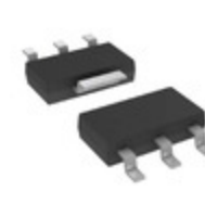
MCP1804T-A002I/DB Microchip Technology IC REG LINEAR 10V 150MA SOT223-3