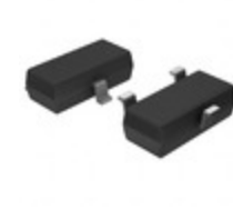
MCP1811AT-012/TT Microchip Technology IC REG LINEAR 1.2V 150MA SOT23-3