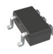
MCP1811AT-033/OT Microchip Technology IC REG LINEAR 3.3V 150MA SOT23-5