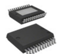
L9958XP STMicroelectronics IC MOTOR DRVR BIPOLAR 24POWERSO