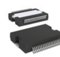
L9951TR STMicroelectronics IC DVR DOOR ACTUATOR POWERSO-36