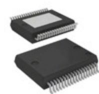
L9954LXPTR STMicroelectronics IC PTS SMARTPOWER