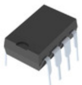
ADM663AAN Analog Devices Inc. IC REG TRI 3.3/5V OR ADJ 8DIP