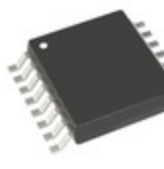
ADM660ARU Analog Devices Inc. IC MULTI CONFIG ADJ .1A 16TSSOP