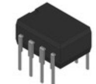
ADM663AN Analog Devices Inc. IC REG LINEAR POS ADJ 100MA 8DIP