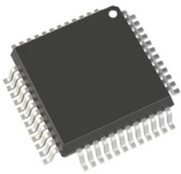
Image may be representation. See specifications for product details.