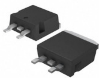
Image may be representation. See specifications for product details.