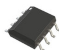
AD586KR Analog Devices Inc. IC VREF SERIES 0.1% 8SOIC