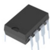
AD586KN Analog Devices Inc. IC VREF SERIES PREC 5V 8DIP