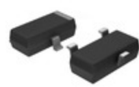
ADR380ARTZ-REEL7 Analog Devices Inc. IC VREF SERIES 0.24% SOT23-3