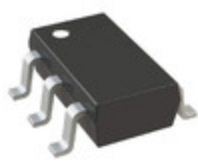
ADR392ART-REEL7 Analog Devices Inc. IC VREF SRS PREC 4.096V SOT23-5