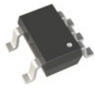
ADR06AUJZ-REEL7 Analog Devices Inc. IC VREF SERIES 0.2% TSOT5