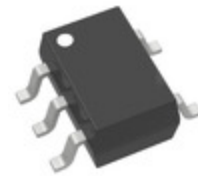
ADR06AKSZ-REEL7 Analog Devices Inc. IC VREF SERIES 0.2% SC70-5