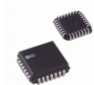
AD767KP Analog Devices Inc. IC DAC 12BIT V-OUT 28PLCC