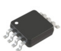
AD7680BRMZ Analog Devices Inc. IC ADC 16BIT SAR 8MSOP