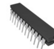
AD767AD Analog Devices Inc. IC DAC 12BIT V-OUT 24CDIP