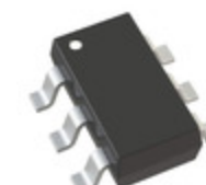
AD7680BRJZ-REEL7 Analog Devices Inc. IC ADC 16BIT SAR SOT23-6