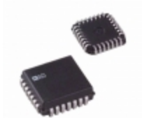
AD767JP Analog Devices Inc. IC DAC 12BIT V-OUT 28PLCC