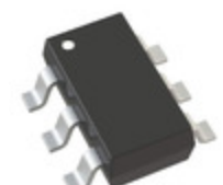
AD7680ARJZ-REEL7 Analog Devices Inc. IC ADC 16BIT SAR SOT23-6