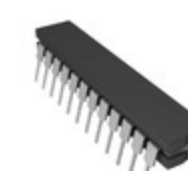
AD767BD Analog Devices Inc. IC DAC 12BIT V-OUT 24CDIP