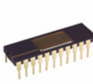
AD767SD/883B Analog Devices Inc. IC DAC 12BIT 24CERDIP