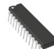
AD767JN Analog Devices Inc. IC DAC 12BIT V-OUT 24DIP