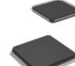
XC9572XL-5TQG100C AMD IC CPLD 72MC 5NS 100TQFP