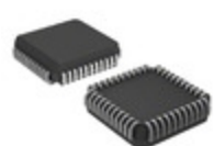
XC9572XL-7PCG44I AMD IC CPLD 72MC 7.5NS 44PLCC