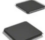
XC9572XL-5TQ100C AMD IC CPLD 72MC 5NS 100TQFP